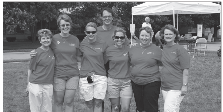
Premium Hearing Solutions Staff